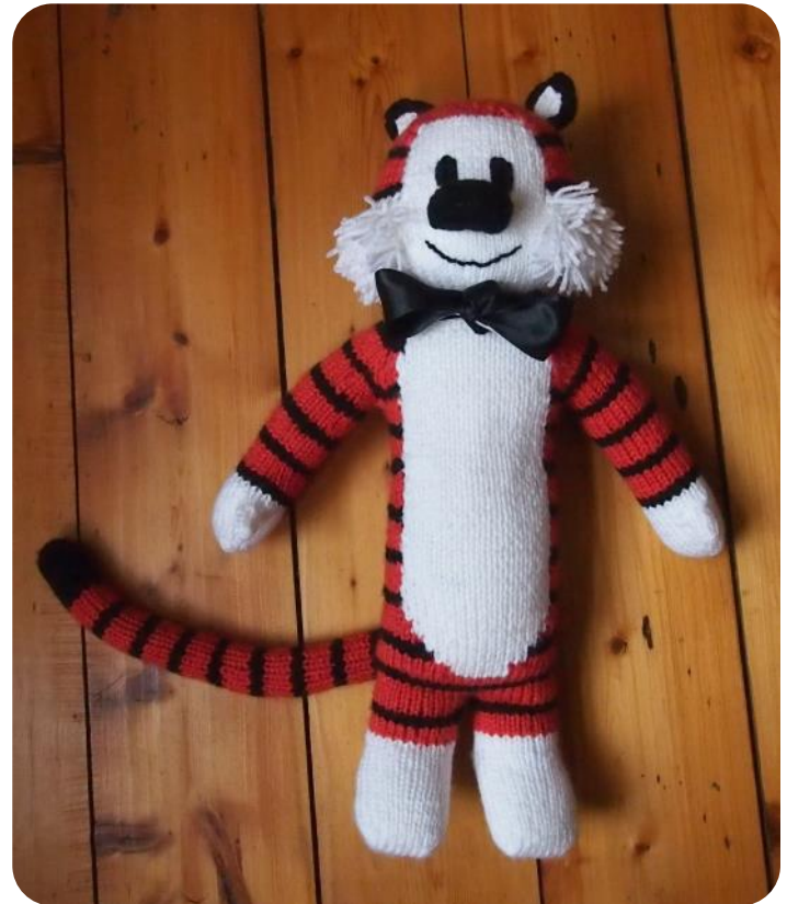
The sample was constructed using intarsia in the round.

The flat intarsia pattern requires pages 1 to 3 and 6 to 7, the charts on pages 8 and 9 do not align with these written instructions.